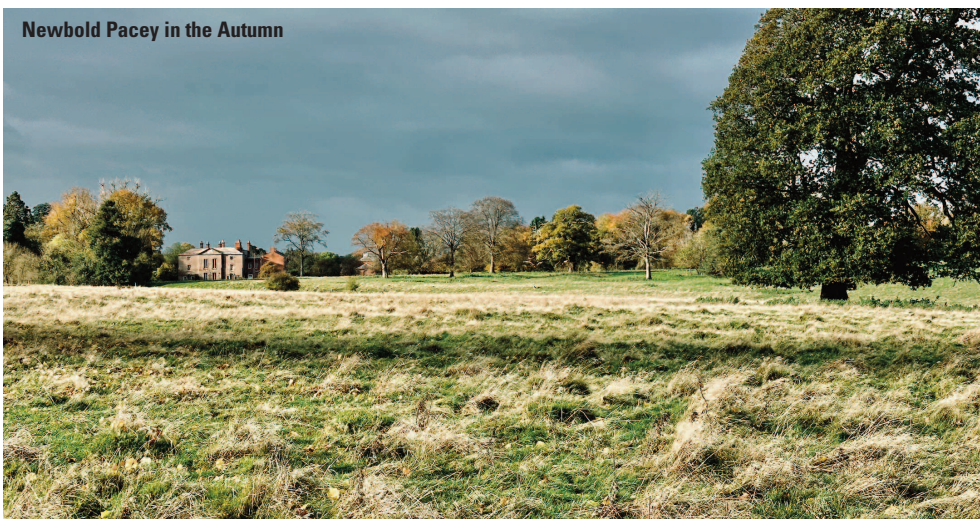
Newbold Pacey in the Autumn