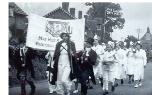
Ashorne Coronation Celebrations 1953

Thanks to the events committee for another successful event, which was enjoyed by everyone.