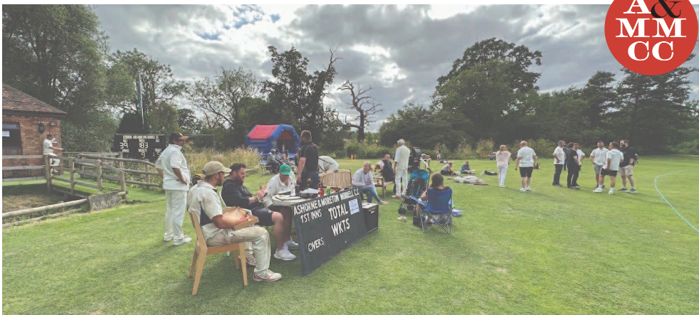
A great family day out at the cricket field recently. Did we win? Don't know.