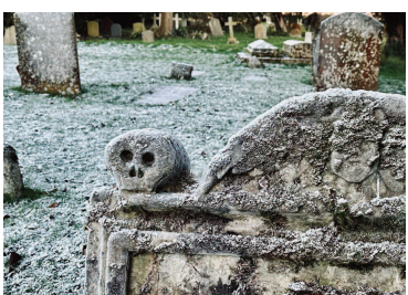
Frosty Fred keeps an eye out in NP graveyard

Significant Parish Council and Village Hut News – inside.